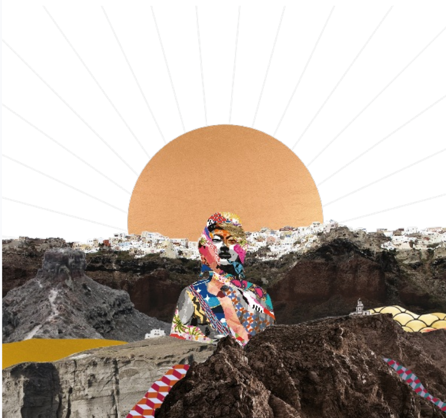
Buddha-Bar Beach Santorini