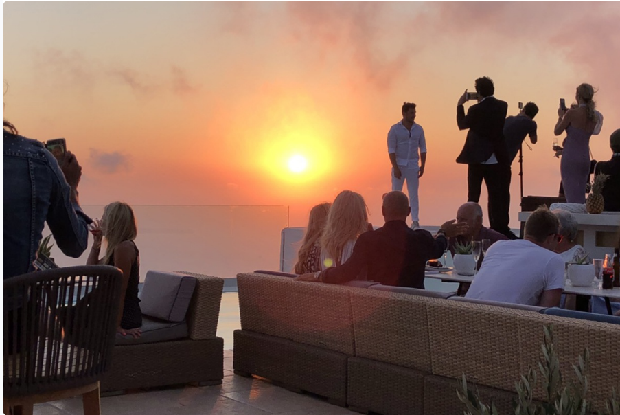
Hosting "Life Art Santorini Sunset Tunes" Event